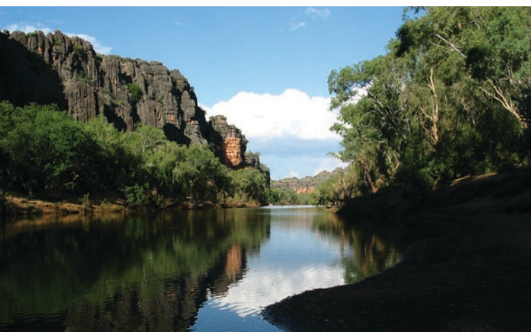
Windjana Gorge, Kimberley WA

Under the direction of the Indigenous Water Policy Group (IWPG) and its partner Land Council Organisations, NAILSMA has established a northern Australia network of six regionally based Indigenous Community Water Facilitators. This network of facilitators is supported by a Coordinator based in Darwin at the NAILSMA Office. The six facilitators are placed in the Fitzroy and Ord catchments in Western Australia, the Katherine-Daly catchment in the Northern Territory, the Gregory in the Southern Gulf, and Mitchell and Wenlock River catchments in the Cape York Region.