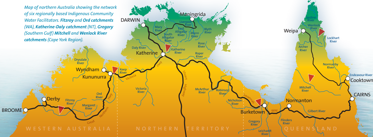
Map of northern Australia showing the network of six regionally based Indigenous Community Water Facilitators. Fitzroy and Ord catchments (WA), Katherine-Daly catchment (NT), Gregory (Southern Gulf) Mitchell and Wenlock River catchments (Cape York Region).