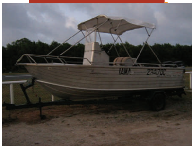
Iama Council vessel to be used as part of the Iamalgal Ranger program.

Projects such as the NAILSMA Dugong and Turtle Project are paving the way for Traditional Owners to implement their management aspirations.