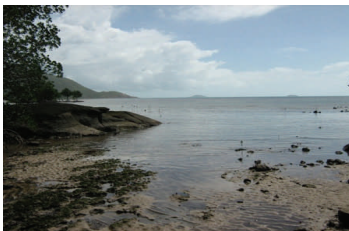
Proposed seagrass monitoring area near sewerage outfall pipe at Woer Ngur.