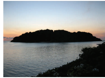
Waier at sunrise.

This training will not only assist Project Officers in their current roles but will provide them with skills to assist their communities in future planning and Ranger activities.