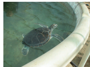
Green turtle spots in the tanks at Ardyaloon Hatchery.