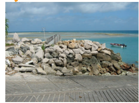
The TSRA is developing a funding application to support land and sea Rangers in Torres Strait.

Full implementation of the Dugong and Turtle Management Plans will take many years. The strong partnerships that have and are being formed between island Project Officers and government and non-government organisations will be essential for their successful implementation.