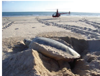
Flatback turtle nesting at Crabb Island.

The TSRA is concurrently developing a funding application to the Australian Government’s Working on Country program. The program has been established to provide wages to Indigenous Rangers to undertake land and sea management activities, such as dugong and turtle management.