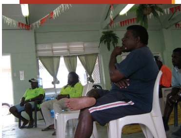
Goemulgau traditional hunters developing the Mabuiag Management Plan.

During May 2008, Traditional Owners from the eight participating islands met with a number of key government and non-government people to discuss the outcomes of the consultation. The meeting aimed to discuss and consider both government and Indigenous perspectives on the plans. The meeting secured in-principle support of the plans based on a set of agreed actions that included some plan amendment. Discussions were led by a number of Elders who provided guidance to the meeting groups. Government agency staff and Traditional Owners agreed that the community based approach taken by the project was successful and that all groups coming together in this way was a success.